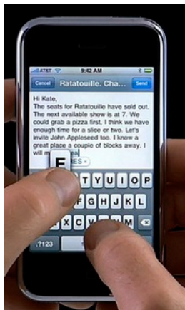
Text Input Portrait

The premise is also simple: you type a message on the iPhone keyboard, and whatever you type is displayed on the iPhone screen in white text with a black background.