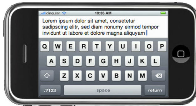
Text Input Landscape